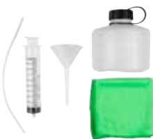
Small Engine Oil Change Kit