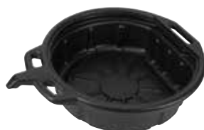
4-1/2 Gallon Oil Drain Pan