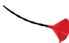
Plastic Funnel w/18" Spout