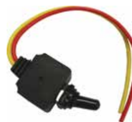
Weather Resistant Pre-Wired Switch