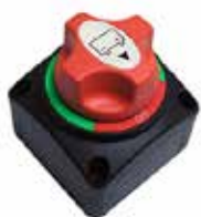
100A Mini Marine I & II Dual Battery Selector Switch

Communities across Canada are now switching their fleets to the white noise alarms to reduce noise pollution and disturbances