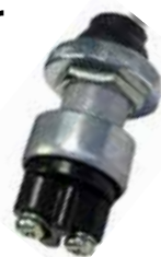
Heavy Duty Push Button/Horn