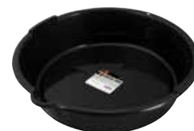
7 qt. Plastic Drain Pan