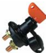
Master Battery Disconnect