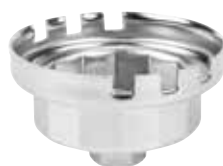
Toyota Canister Oil Filter Wrench