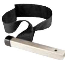
Heavy Duty Strap Filter Wrench up to 6" W173C