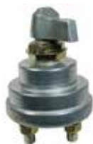
UL 588 Heavy Duty Master Battery Disconnect