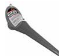
Clear View Long Reach Funnel 1/2 pt.