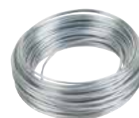
25' Roll Mechanics Wire